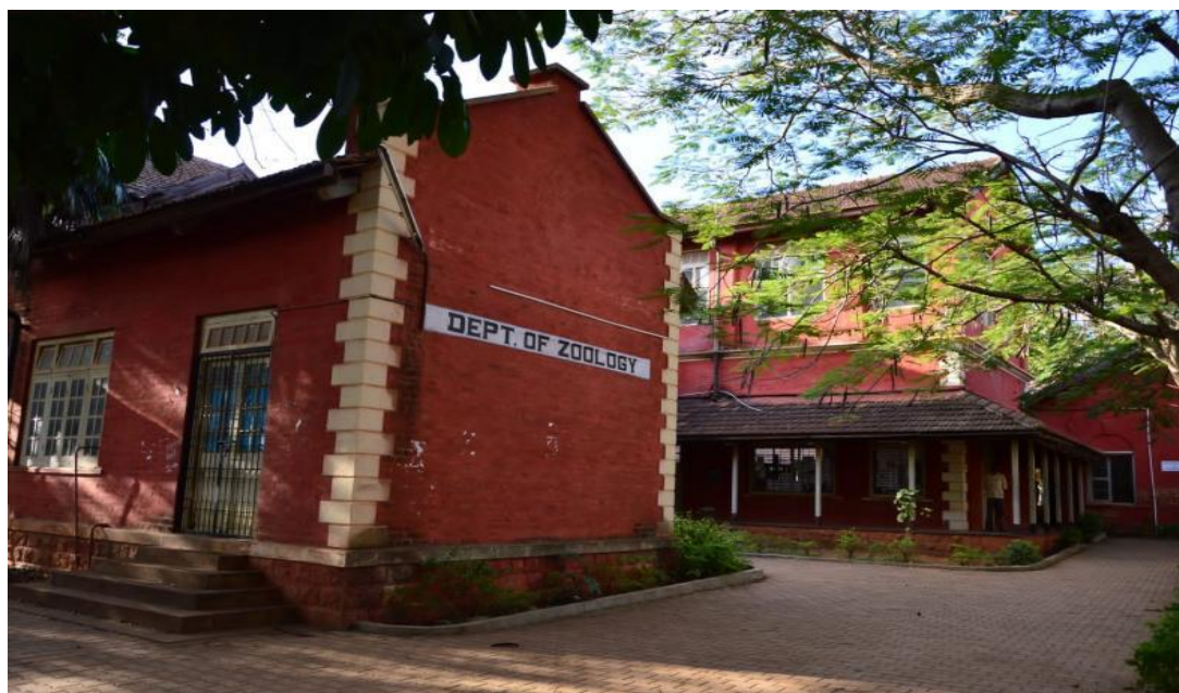
Building housing the Department of Zoology, KSCD

published from the department in National and International journals. All the teaching staff are student friendly and the department offers courses from B.Sc. to Ph.D.