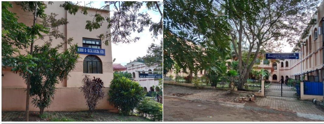
The building housing the Department of Computer Science, KSCD

provide quality education at very low cost to the student. Due to the implementation of NEP-2020, KUD has closed down the B.Sc (CS) course with effect from 2021-22.