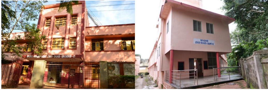
Photographs of the buildings of Kaveri Hostel (Block 1 and Block 2), which are present in the Karnatak College Campus.

All National and State festivals, like Independence Day, Karnataka Rajyotsava, Republic Day, Gandhi and Shastri Jayanti, Swami Vivekananda Jayanti and Dr. B. R. Ambedkar Jayanti are celebrated in the hostel. Apart from these celebrations, there is also the culture of conducting Hostel Day, where a renowned woman achiever is invited as the Special Invitee.