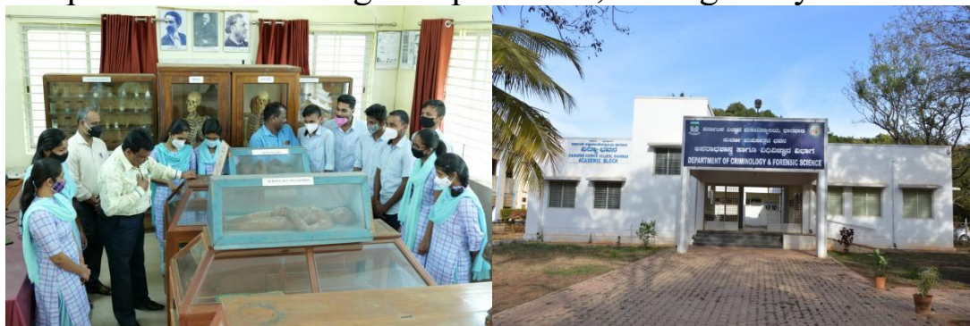
Museum of the Department of Criminology and Forensic Science, K.Sc.C.D. Right: The building housing the Department of Criminology and Forensic Science, Karnatak Science College, Dharwad.

Department, containing rare collections. The museum in the Department of Criminology and Forensic Science, K.Sc.C. D has a collection of wax models, photographs of pioneers in the field of Criminology and Forensic Science, charts on motor vehicle and train accidents, photographs of finger prints and footprints and toxicological specimens, among many others.