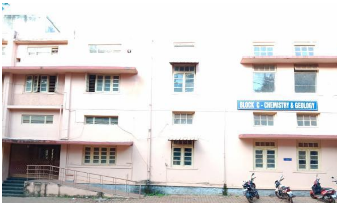
Picture of the building of Karnatak Science College, Dharwad, which houses the Principal's Chamber, Office, UG & PG Department of Chemistry, the Statistics Lecture Hall and the Department of Geology KSCD